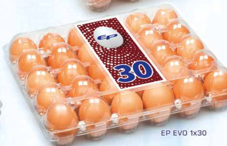
EP EVO 1x30