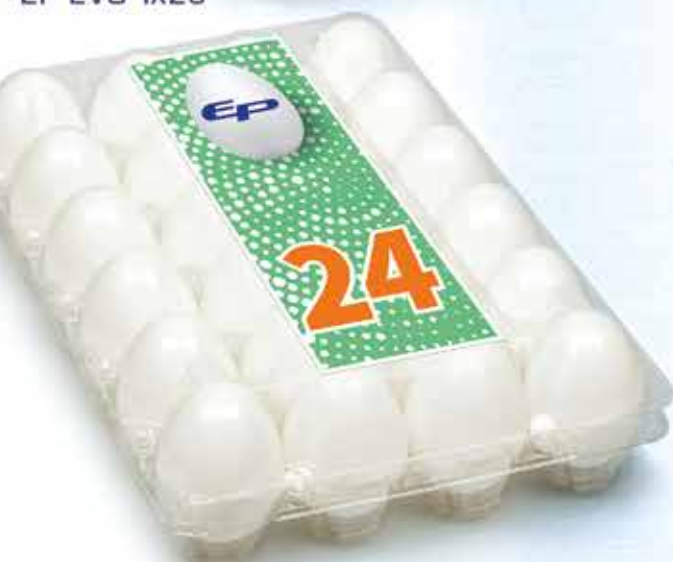
EP EVO 1x24