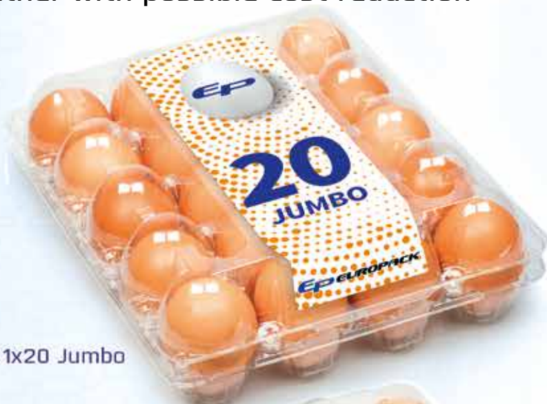
EP EVO 1x20 Jumbo