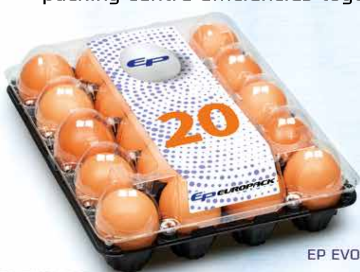
EP EVO 1x20

EUROPACK offer new concept family packaging for 20/24/30 eggs which brings new possibilities for shelf presentation and also to enable better packing centre efficiencies together with possible cost reduction